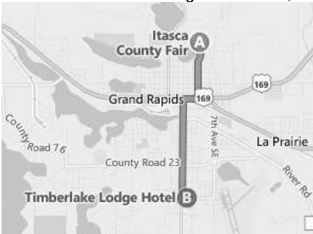
Timberlake Lodge Location

FRIDAY NIGHT Social with door prizes at Timberlake Lodge - September 15 th in the Oak Room. Social Hour will begin at 5:30 PM, and there will be a cash bar and Heavy hors D'oeuvres.